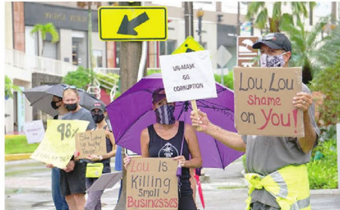
PROTEST: Demonstrators hold up signs during the Global Health & Freedom Rally in Tumon early Saturday morning. The rally was held to bring attention to the "authoritarian" approach by global leaders in response to the COVID-19 pandemic.