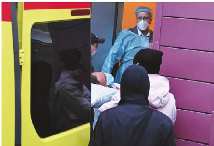
MEDEVAC: Medical specialists carry Russian opposition leader Alexei Navalny on a stretcher into an ambulance on their way to an airport before his medical evacuation to Germany in Omsk, Russia, on Aug. 22.

"Those responsible must be identified and held accountable," Merkel added.